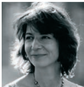
Michaela Pavlátová Czech Republic